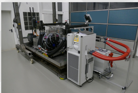
>> Axial sealing rig