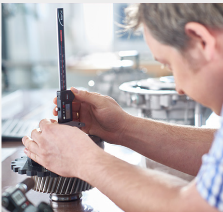
>> Attention to detail

Prototypes represent a significant milestone in the development of new products. MAHLE ZG Transmissions achieves this milestone together with their selected partners – no matter whether “only” a gear wheel or an entire gearing (e.g. an automatic gear for cars) is required.